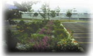
Low-Impact Development for Commercial Property, Prince George's County, MD