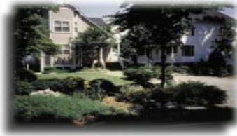
Low-Impact Development, St. Mary's County, MD