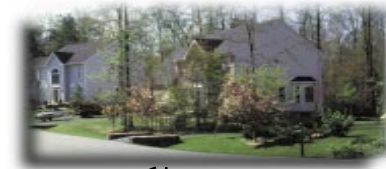
Forest Conservation Through Site Fingerprinting Reduced: Imperviousness Through Narrow Road Widths; Open Drainage Swales