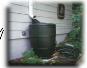
Runoff Retention Using Rainbarrel