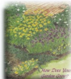
Public Participation Through Homeowner BMP Maintenance