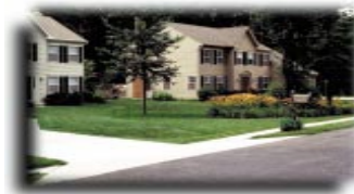
Runoff Retention Using On-lot Bioretention; Runoff Detention Using Modified Open Drainage Swale