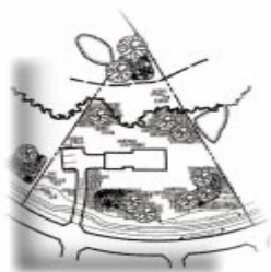
Plan View Schematic of Low-Impact Development Residential Lot